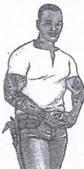
Body Tight pia Kujichora Tattoo