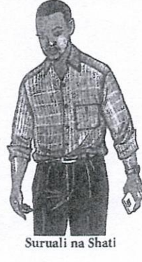
Suruali na Shati