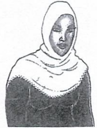
Hijabu na Baibui