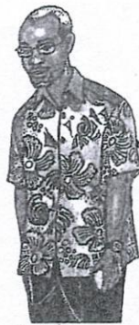
Shati la kitenge na batiki