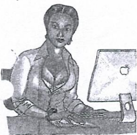
Blouse zinazoacha kifua wazi