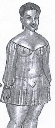
Nguo zinazoonyesha ndani