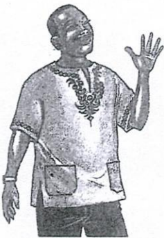
Shati la cholai