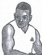
Vest aina zote