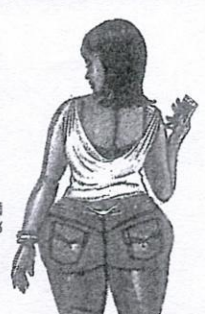
Mgongo wazi na nguo za ndani kuonekana