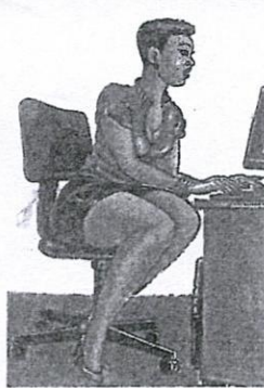
Sketi fupi (Mini skirts)