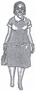
Gauni chini ya Magoti