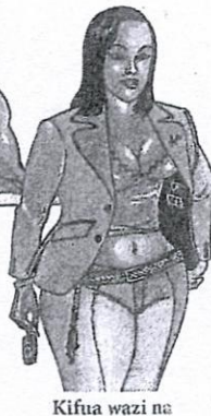
Kifua wazi na tumbo nie