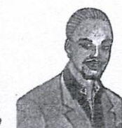
Kusuka nywele na hereni kwa wanaume